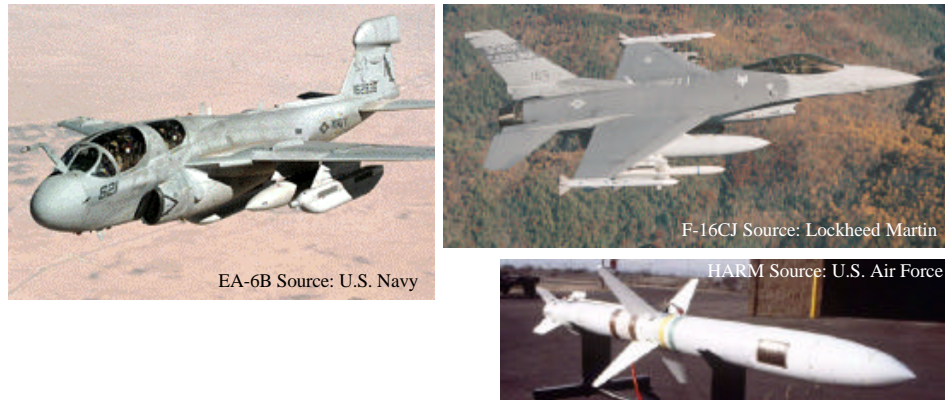
Figure 2. Key SEAD Assets

The primary topic of ECM-related conversation following Operation Allied Force, was widespread praise of towed radar decoys. Although they did not debut in Kosovo, towed decoys were used more pervasively in this conflict than in the past. These ECM were credited with saving several aircraft such as the B-1 bomber from Serbian SAMs. Some have described towed decoys as “...one of the key enablers of last year’s bombing campaign.” 21 However, there were ECM deficiencies as well as successes. The ALE-39 countermeasures dispenser, for instance, was not sufficiently reliable. The ALE-39 – which is found on EA-6B, F-14, F/A-18 and AV-8B aircraft – at times did not dispense countermeasures (flares or chaff) when it was supposed to. Conversely the dispenser also ejected countermeasures without prompting, leaving the pilot with none available when they were needed.