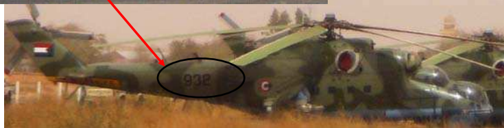
El-Fasher, 26 February 2007