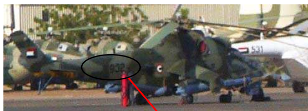
Khartoum, 28 January 2007